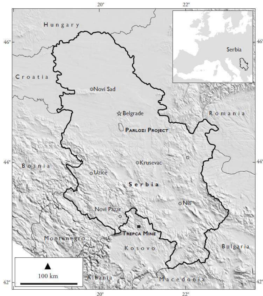
Figure 1: Map of Serbia showing the location of the Parlozi project. Inset map showing the location of Serbia in Western Europe.

Mineral exploration in the Parlozi Permit area during the 1970s and 1980s, by state-controlled companies of the former Yugoslavia, included 36 drill holes totalling 15,105 meters, exploration adits, airborne and ground geophysical surveys, and detailed geological and mineralogical studies. Based on this work, in 1986 the Serbian Geo Institute calculated an historical resource estimate at Parlozi prospect, classified as C1 plus C2 resources according to the Yugoslav reporting system of 6.5 million tonnes at an average grade of 4.1% lead, 2.1% zinc, 0.3% copper and 130 g/t silver within the Permit area. This historical resource estimate was not estimated under the guidance of National Instrument (NI) 43-101 and does not meet the CIM definition standard for classification as mineral resources or mineral reserves. Investors are further cautioned that a qualified person has not yet completed, on behalf of Midlands, sufficient work to be able to verify the historical resource estimate, and therefore they should not be relied upon. The historical resource estimate is only considered as relevant as a guide to future exploration.